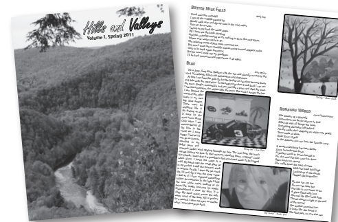
The Literary Awards are based on prose and poetry contributions to our new literary magazine, "Hills and Valleys."