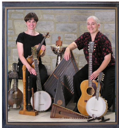
For 2012, we will be bringing Simple Gifts, a superbly talented musical duo who will present a hands-on program for elementary school students this spring. It will be the first major production in our greatly expanded music program.

However, this was a minor annoyance when balanced against the widespread personal devastation, especially in the Sonestown and Hillsgrove areas, where houses were destroyed, crops obliterated and roads made impassible. It's a mark of the resilience and superb good grace of county residents that everyone has come together to support their neighbors and to clean, mend and rejuvenate the area.