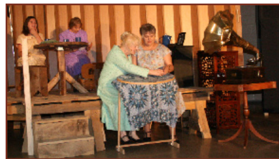
"Diamonds and Coal" - Making do in the Great Depression.

"Diamonds and Coal" (2011): Two of the defining endeavors in 20th century Sullivan County: mining and baseball in Bernice-Mildred.